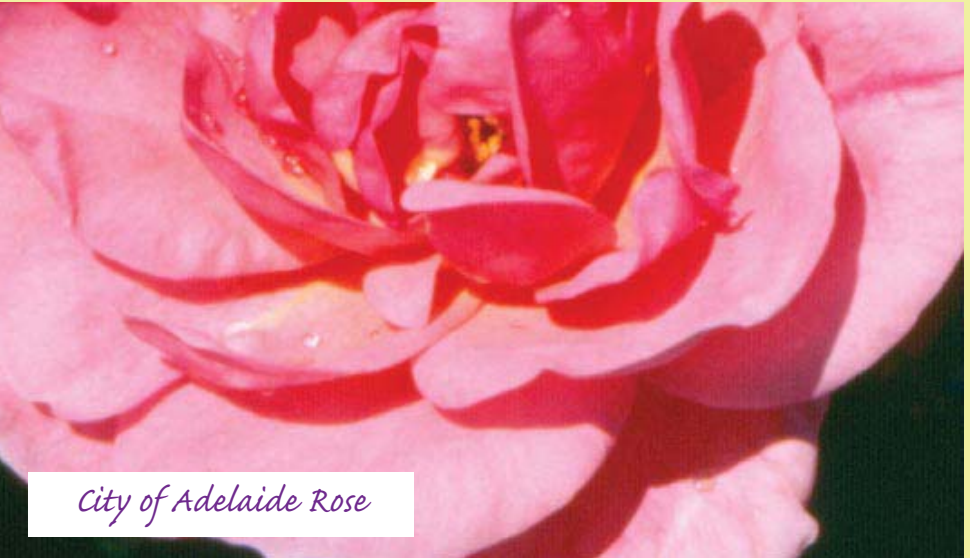
City of Adelaide Rose

Roses are special to Adelaide. Adelaide was the first Capital City in Australia to have a rose named after it and we have more public rose gardens than any other capital in the nation.